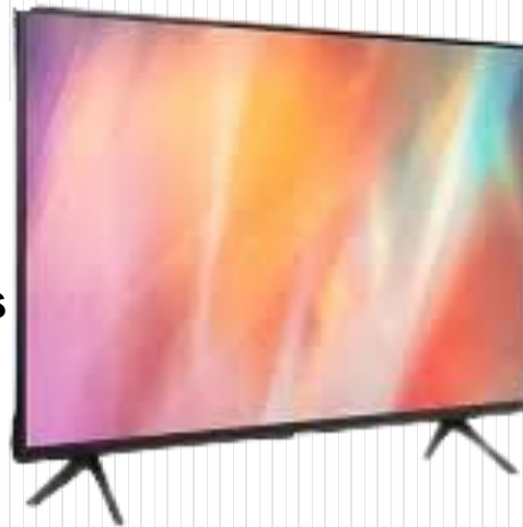
55" LEDSmart TV

Supported Apps: Netflix|Prime Video|Disney+Hotstar|Youtube Operating System: Google TV Resolution: Ultra HD 3840 x 2160 Pixels Sound Output: 20 W Refresh Rate: 60 Hz