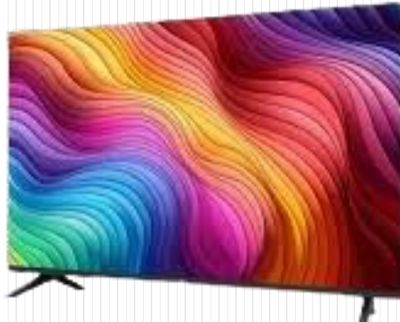
32" LEDSmart TV