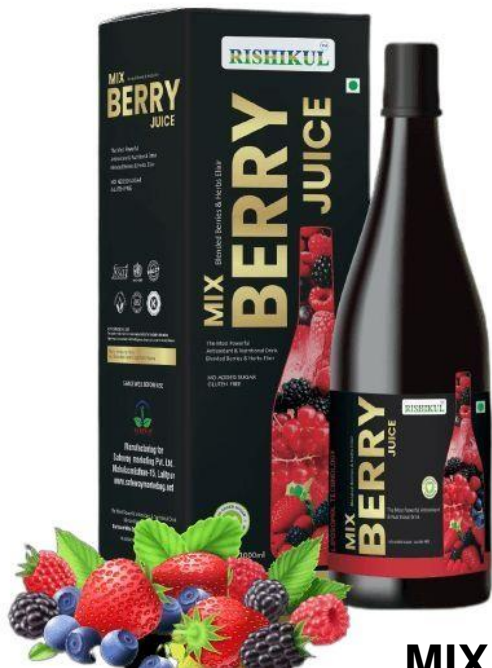
MIX BERRY JUICE