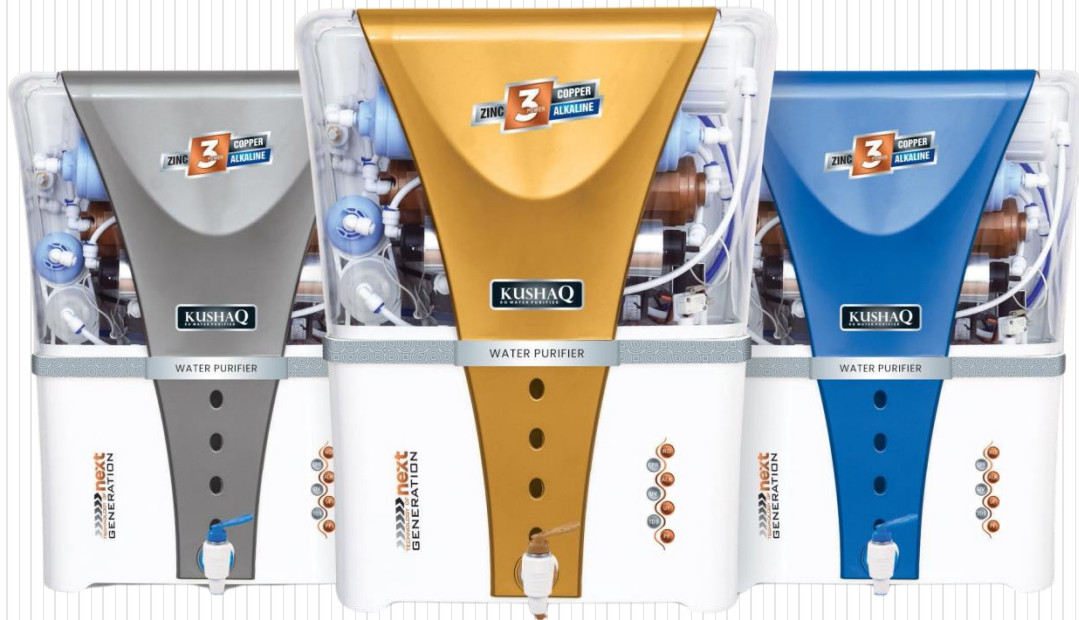
RO WATER PURIFIER